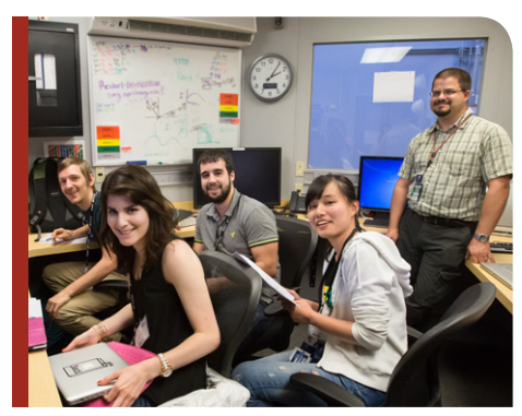
SEQUOIA team supported experiments during Neutron and X-Ray Scattering School in 2015.

2015 was a good year for SEQUOIA's publication output. Five Ph.D. dissertations included SEQUOIA measurements this year and 13 peer reviewed publications were accepted. These included several high profile publications from the beam line. Congratulations to all of the authors. The 2015 APS March Meeting also had a large number of presentations that featured SEQUOIA results. We know of a few other publications that are currently in review, and we expect 2016 to be another productive year for the instrument. A list of SEQUOIA