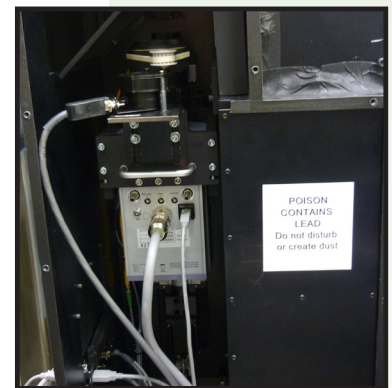
Detector housing for the CCD camera lens, mirror, and scintillator.