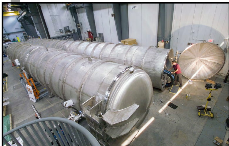
Detector tanks for the SANS instruments at HFIR. The Bio-SANS detector is on the left.

SANS instrument is supported by additional CSMB capabilities that include development of advanced computational tools for neutron analysis and modeling, as well as biophysical characterization and x-ray scattering infrastructure. A dedicated biological sample preparation laboratory is located adjacent to the instrument.