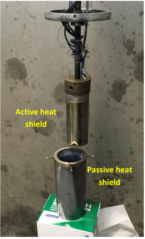
Figure 5. Sample stick and heat shields.

u. For lower temperature (≤500 K) operation only, on the Pump/Purge/Backfill screen, press the Backfill Only button. The sample space will be filled with approximately 100mbar of He.