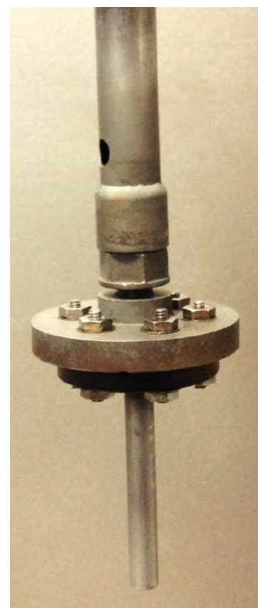
Figure 3. Sample can on stick.