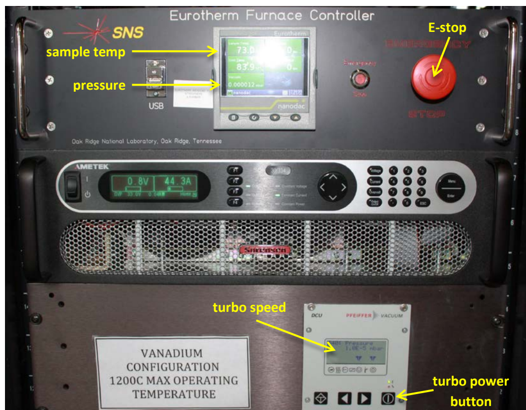
Figure 1. MICAS furnace controller.