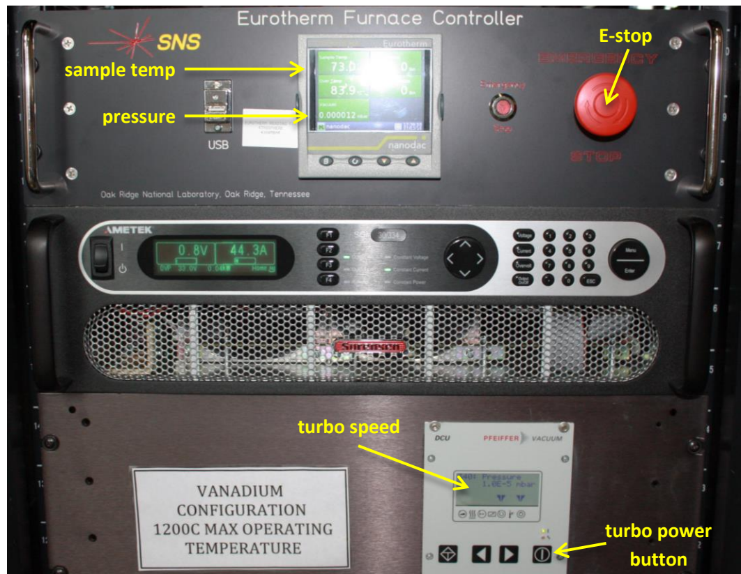
Figure 2. MICAS furnace controller.