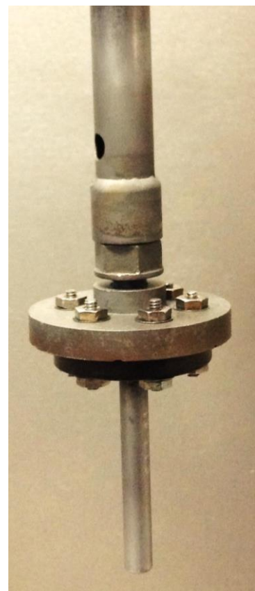
Figure 4. Sample can on stick.